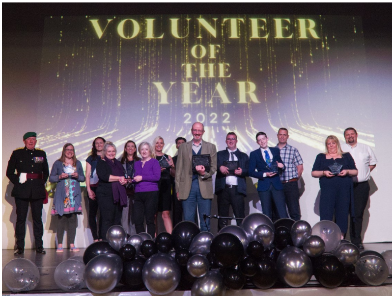
Speakers and winners from Volunteer of the Year 2022

The night, attended by over 100 people saw many awards presented to 12 worthy nominees who had spent years dedicating their lives to volunteering across Argyll & Bute, with a special lifetime achievement award for a Mull resident who had spent 30 years committed to volunteering in his local community.